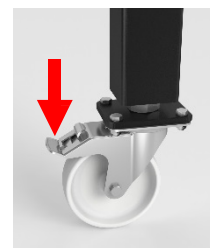
option: castor fine adjustment max. 40 mm