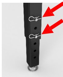
option: height adjustment fine adjustment max. 40 mm